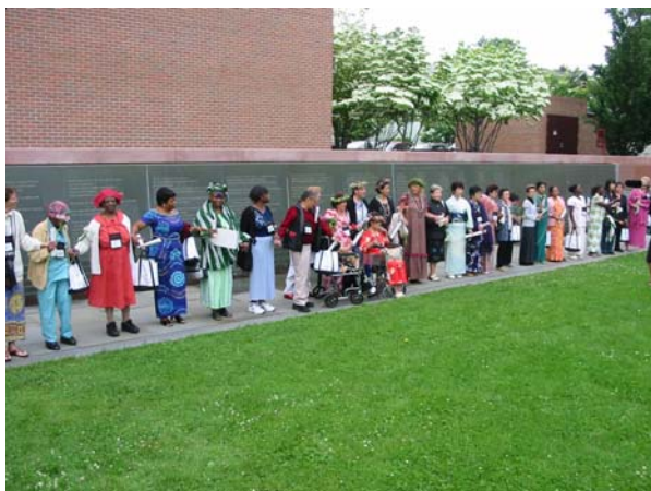
IDEA members from around the world gather at Women's Rights National Historical Park in Seneca Falls as part of the First International Conference on Issues Facing Women Affected by Leprosy, 2002.