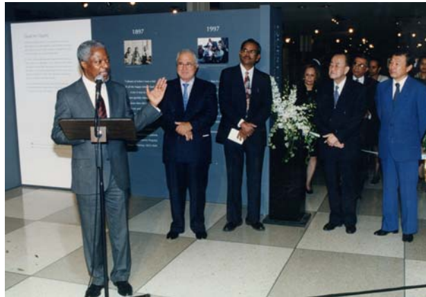
The Quest for Dignity Exhibit is launched at the United Nations on October 30, 1997.