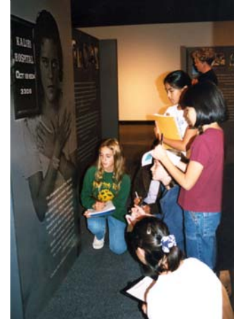
Students visit the Exhibit at the Herbst International Exhibition Hall, The Presidio, San Francisco, in 1999.

Launched at the United Nations by UN Secretary General Kofi Annan, the Quest for Dignity Exhibit has been translated into several languages and displayed in different sizes and various formats in 10 countries, including: Luxembourg, Italy, Germany, the Czech Republic, Brazil, India, P. R. China, Switzerland, the Philippines, Japan, and South Africa. The Exhibit continues to evolve and expand, with funding provided by The Nippon Foundation, Japan. The English version of the Quest for Dignity Exhibit forms the foundation for the IDEA Center for the Voices of Humanity in Seneca Falls, New York.