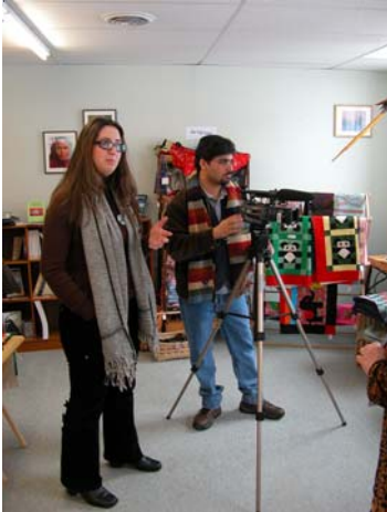
Voice of America journalists from Afghanistan, India, and Indonesia videotape interviews at the IDEA Center.