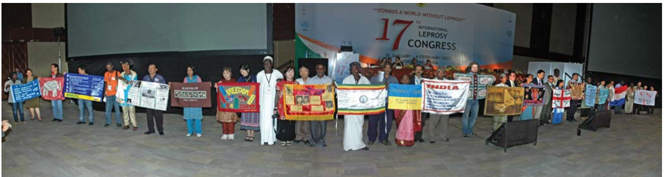
IDEA's Banner of Honor is displayed at the 17th International Leprosy Congress to assert the right of people affected by leprosy to be included in their own history.

Publication of the IDEA newsletter is made possible through a grant from the Sasakawa Memorial Health Foundation