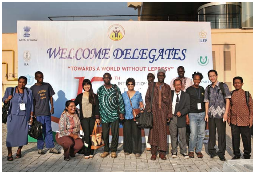
Members of IDEA arrive at the 17th International Leprosy Congress.