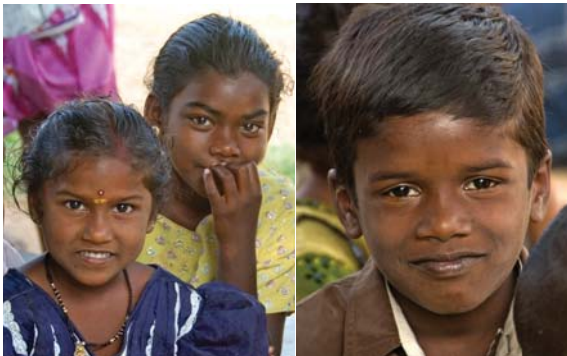
Recipients of IDEA scholarships in Tamil Nadu.

IDEA shall invest in the potential of each individual to insure their right to live where they choose, marry whom they wish, worship where they desire, provide for themselves and their family, and ensure that their children receive an education.