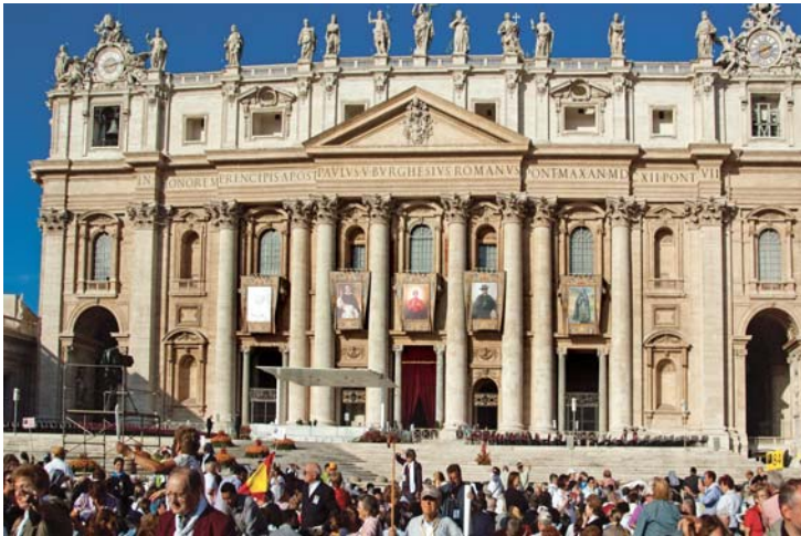
St. Peter's Basilica, Rome, October 11, 2009. Father Damien's banner can be seen second from the right.

-- “A Quest for Justice: A Resolution on the Occasion of the Canonization of Father Damien De Veuster by and for Individuals Affected by Leprosy Throughout the World” (Excerpts appear on this page and the next. Full text can be seen at www.idealprosydignity.org )