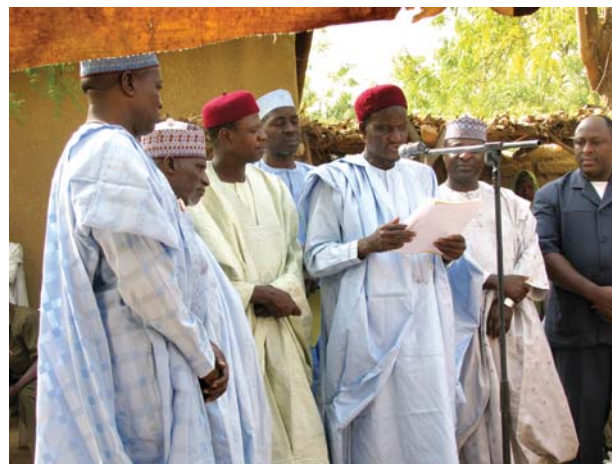
Officials discuss the right to shelter on World Leprosy Day.

Report by Abdou Yohanna: This year, the World’s Leprosy Day (celebrated in Niger Republic on February 14th) focused on “the right to shelter” due to the challenge that people affected by leprosy are facing wherever they are living in this country. In Maradi Town, two wealthy people built 93 standard houses for people affected by leprosy in 1981. Today, after 30 years, most of the houses need repairs. In Niamey, the Capital city, only 35 out of 212 people affected by leprosy are living in their own houses, which have deteriorated in different ways. Other people are either sleeping on the floor before closed shops, or living in huts where they could be chased out at any moment . . .