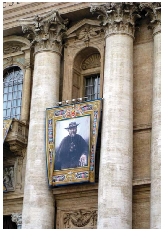
Father Damien's banner hangs on the outside of St. Peter's Basilica in preparation for his canonization.