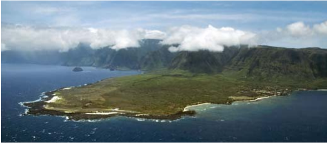
The Makanalua peninsula, commonly known as Kalaupapa.