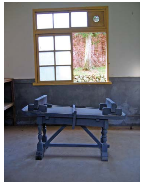
Table upon which forced sterilizations were performed, Sorok Island.

-- S.K. Jung, President of IDEA, who went to Sorok Island as a teenager