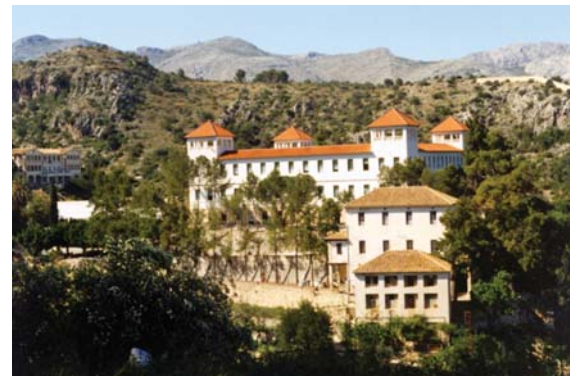
Sanatoria San Francisco de Borja, Fontilles.

-- Excerpts from The Fontilles Resolution, adopted at IDEA’s International Workshop entitled “The Last Leprosy Hospitals and the People Who Call Them Home,” held April 14-18, 1997, at Fontilles