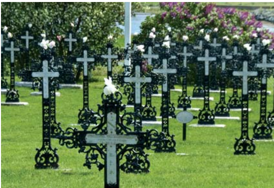
The cemetery for individuals who had leprosy and lived in the hospital at Tracadie, New Brunswick, Canada.