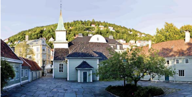
St. Jørgen's Hospital.

One of Scandinavia's oldest hospital institutions, St. Jørgen's Hospital was established in the early 1400's. In the 1870's, more than 170 people with leprosy were being treated there. The last two residents died in 1946. After over 50 years at St. Jørgen's, they both died within a few months of each other, at 82 and 78 years old.