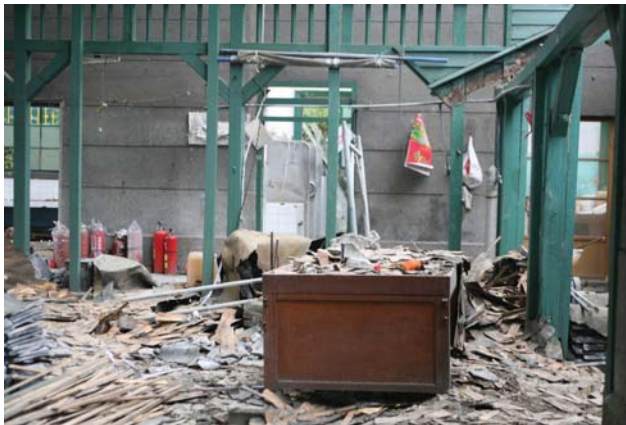
While the destruction of Lo Sheng proceeds, residents continue to try to preserve their history and their home.