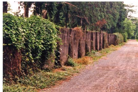
Wall separating the Kikuchi Keifu-en Sanatorium, Japan, from the rest of the world. Holes can still be seen that were scraped by residents so that they could have a glimpse of the outside world. Kikuchi Keifu-en was opened in 1909 as the Kyushu Hospital.