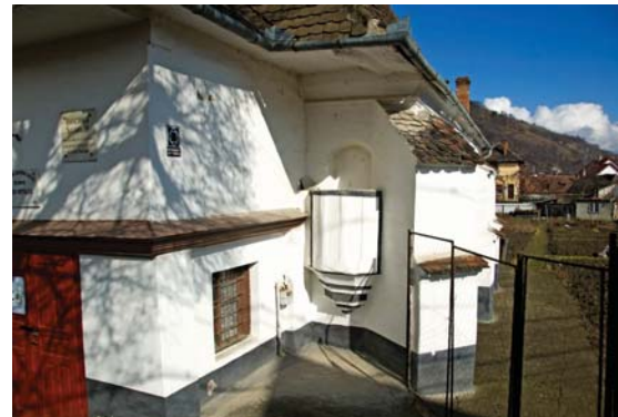
A 15th century Gothic chapel in Sighisoara, Romania, was used by people who had leprosy between 1647 and 1684. Not allowed inside, those with leprosy listened to the priest as he preached from a pulpit built on the outside of the church.