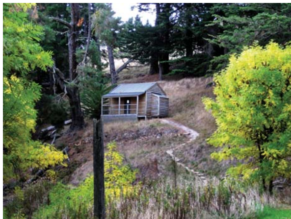
A reconstructed hut on Quail Island.

"We feel that we should do all we can to help in the war effort, and we at Makogai can help by doing without some of the small luxuries which are not strictly necessary. We would be pleased if you will present to the New Zealand Red Cross £100 of the money collected for us."