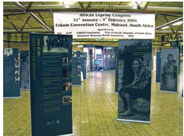
The Quest for Dignity Exhibit is displayed in the lobby of the Eskom Convention Center.