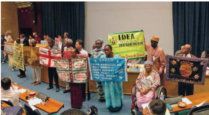
IDEA Members display the IDEA Banner of Honor at the Opening Ceremony of the African Leprosy Congress. The panels are made by different countries to remember individuals who have had leprosy who have made important contributions to their communities, their countries and the world.