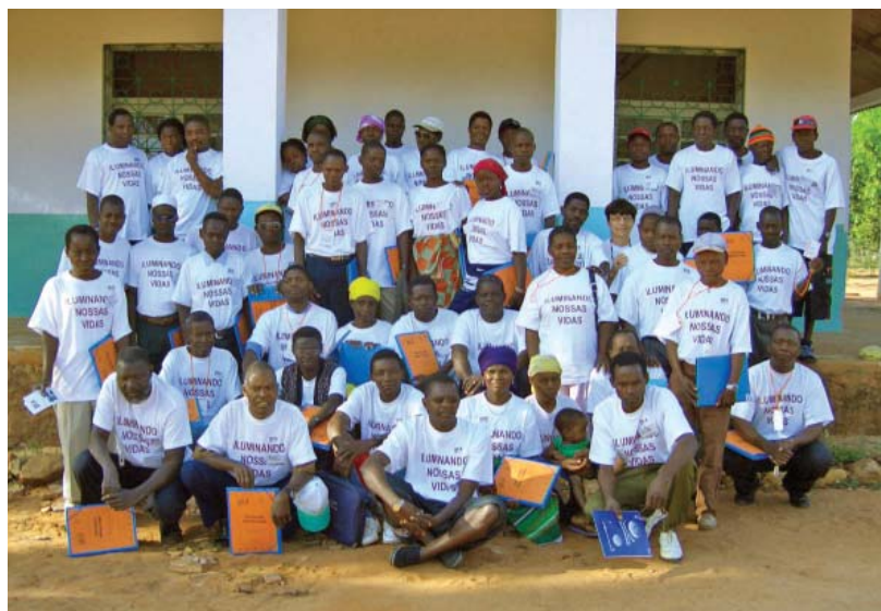
Fifty-six individuals participated in IDEA’s Mozambique workshop, 53 from Mozambique and three international representatives.

“The workshop united us in heart with all the people in the world who were or are affected by leprosy and gave us the possibility of exchanging experiences and together seeking solutions to the problems that we face every day of our lives.”