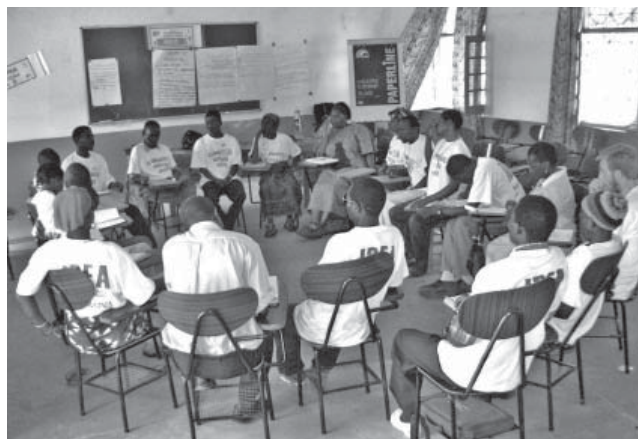
Mozambique workshop.