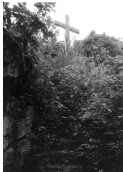
"Peace Hill" at Palo Seco Leprosy Hospital, Panama, designed for contemplation as a place where the residents could look out at the countryside toward their homes.