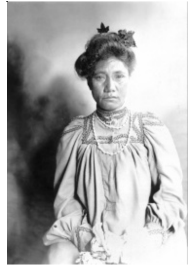
Unidentified resident of Kalaupapa, early 1900's.