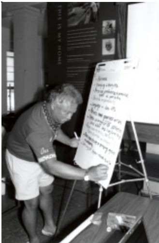
Rep. Sol P. Kaho'ohalahala

"The past inspires and dignifies the present to malama, take care of, the future of Kalaupapa."