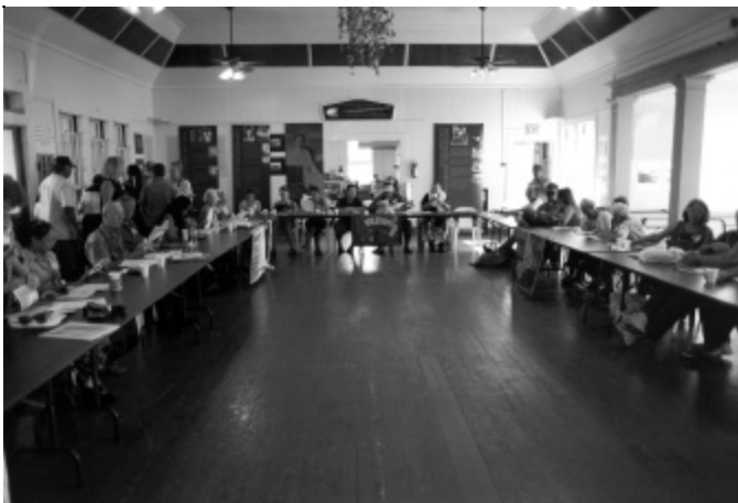
(Left) Founding Meeting of Ka 'Ohana O Kalaupapa, August, 2003, Kalaupapa, Hawaii